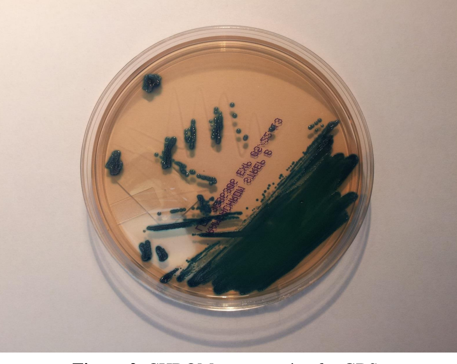
Figure 2. CHROMagar negative for GBS.

A total of 49 of 115 (42.6%) vaginal/rectal specimens were positive for GBS as determined by Carrot broth subculture to Detect. LIM broth (6 hour incubation) subculture to CHROMagar had a sensitivity and specificity of 91.8% and 86.4%, respectively, while LIM broth (24 hour incubation) subculture to CHROMagar had a sensitivity and specificity of 93.9% and 81.8%, respectively (TABLE 1).