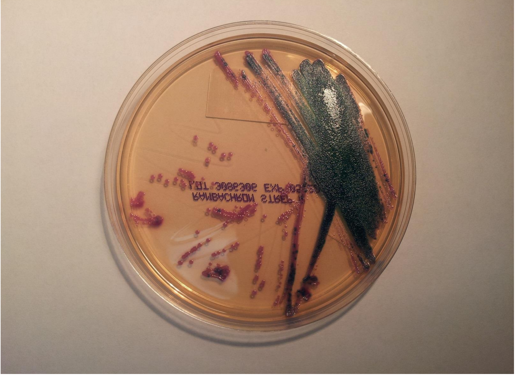
Figure 3. CHROMAGAR positive for GBS.

TABLE 1. Performance of LIM RambaQuick subculture to CHROMagar StrepB compared to Carrot broth subculture to Detect (N=115)