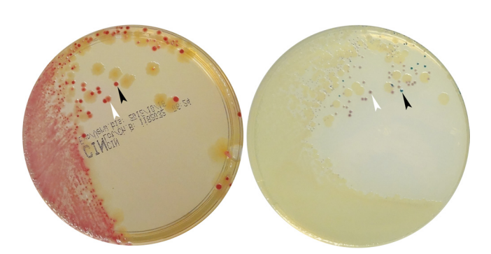
FIG 2 Colonies plated on cefsulodin-irgasan-novobiocin (CIN) agar (left) and CHROMagar Yersinia (CAY; right) from a stool specimen containing Citrobacter freundii, Morganella morganii, and pathogenic Yersinia enterocolitica. On CAY, mauve colonies of pathogenic Y. enterocolitica (white arrowheads) can be readily distinguished from blue-green colonies of C. freundii (black arrowheads) after 48 h of incubation at 28°C.